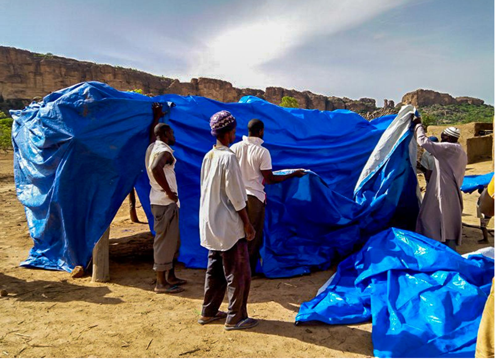
Building shelters for the refugees.