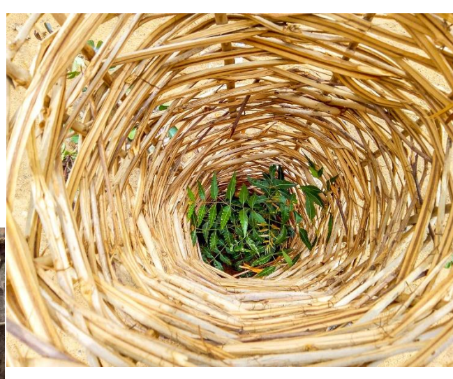
villagers have been experimenting with raising a few seedlings to gain some experience with cultivating a variety of species.