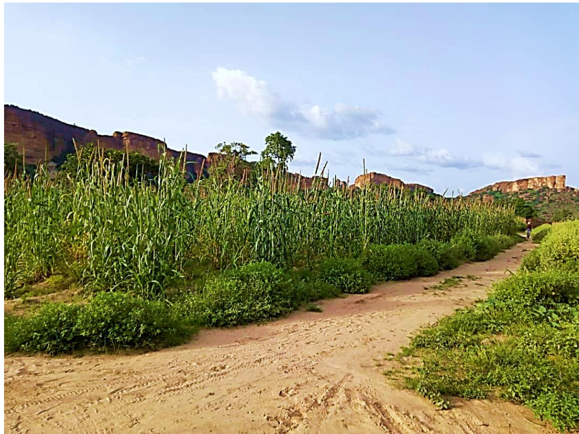
Farm field outside the village.