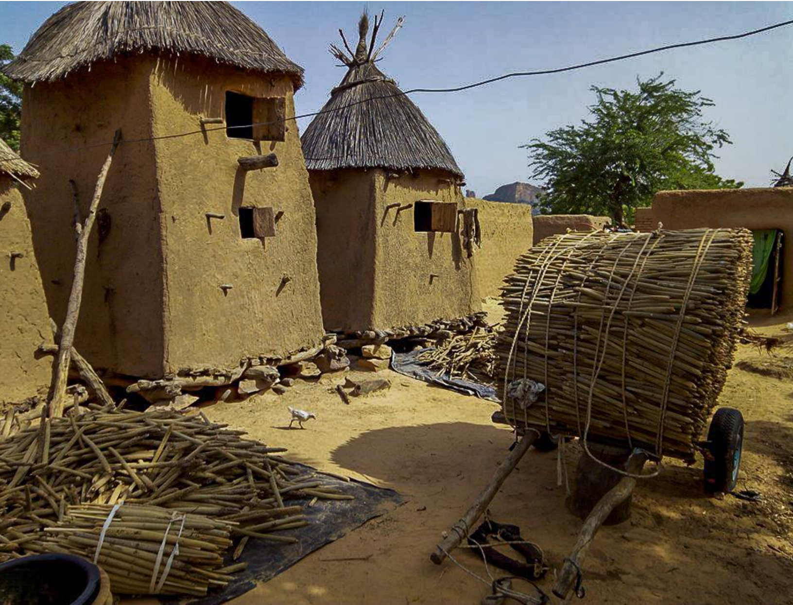
Doundiourou with Dogon huts.