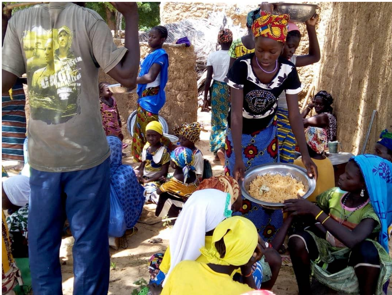
Lunch time at school.

Mere-odjou and the villagers started the work to extend the school at the end of 2022 by initiating the construction of a second building. We are very excited about the success of this project. Unfortunately, our current fundraising does not allow us to support such extension, let alone pay for an increased number of meals. We are obviously thrilled about the success of the meals in allowing an improvement in education in the area, but without extra support we will not be able to let Doundiourou reach its full potential. We would be extremely grateful for any additional support to finance this success the villagers have created with FOD support.