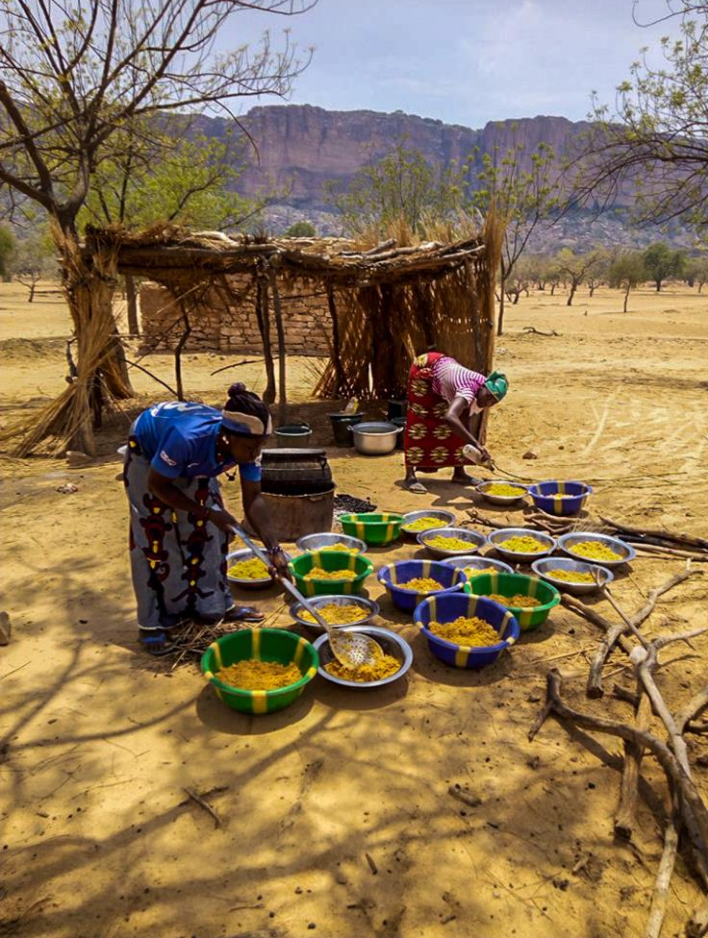
Mere-odjou at work.

Increase in the number of pupils vs. 2019: +14 children (+7%)