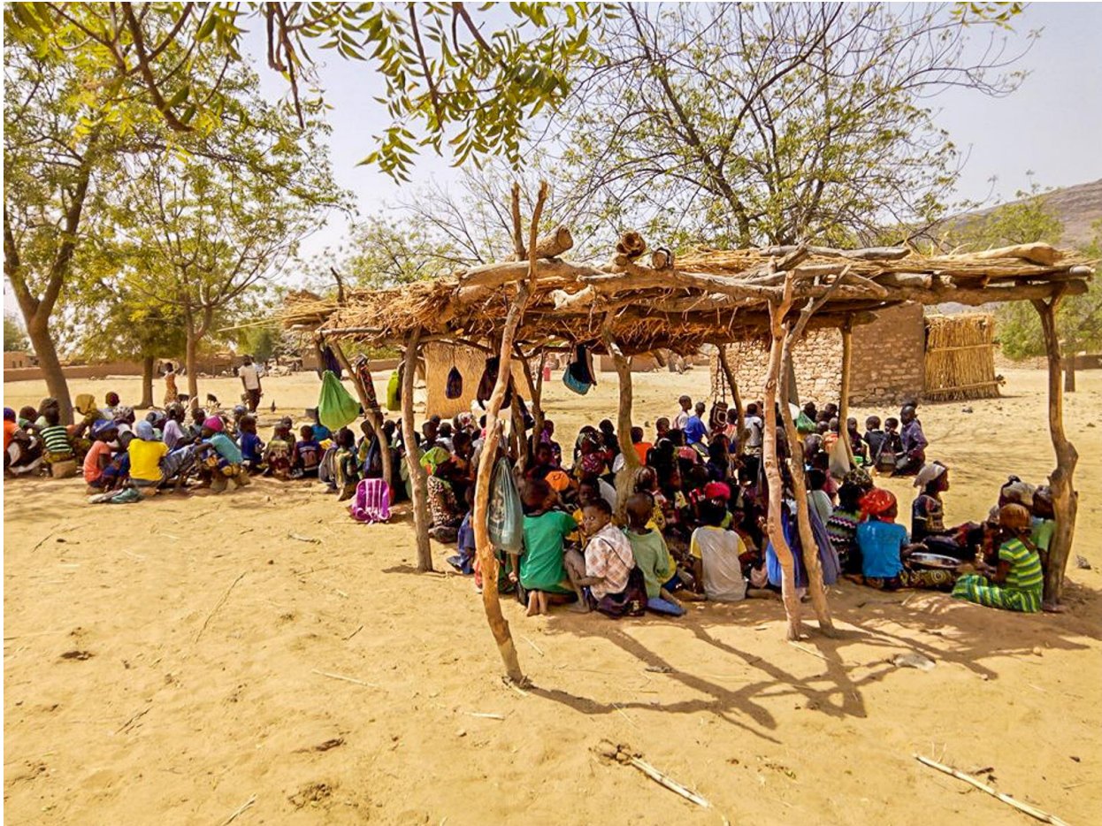
Lunch hour for pupils of Doundiourou.

trend in student enrollment poses a challenge to funding. While at FOD we are thrilled about this success the meals create in school enrollment and betterment of education in the area, we need your help for increased fundraising to cover this significantly higher expense.