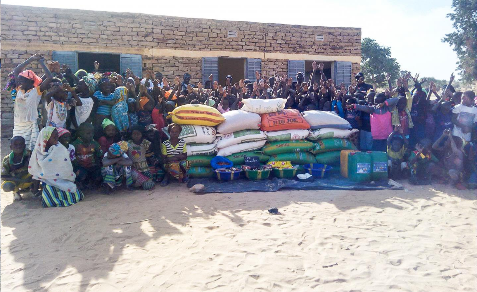
Refugee aid in July.