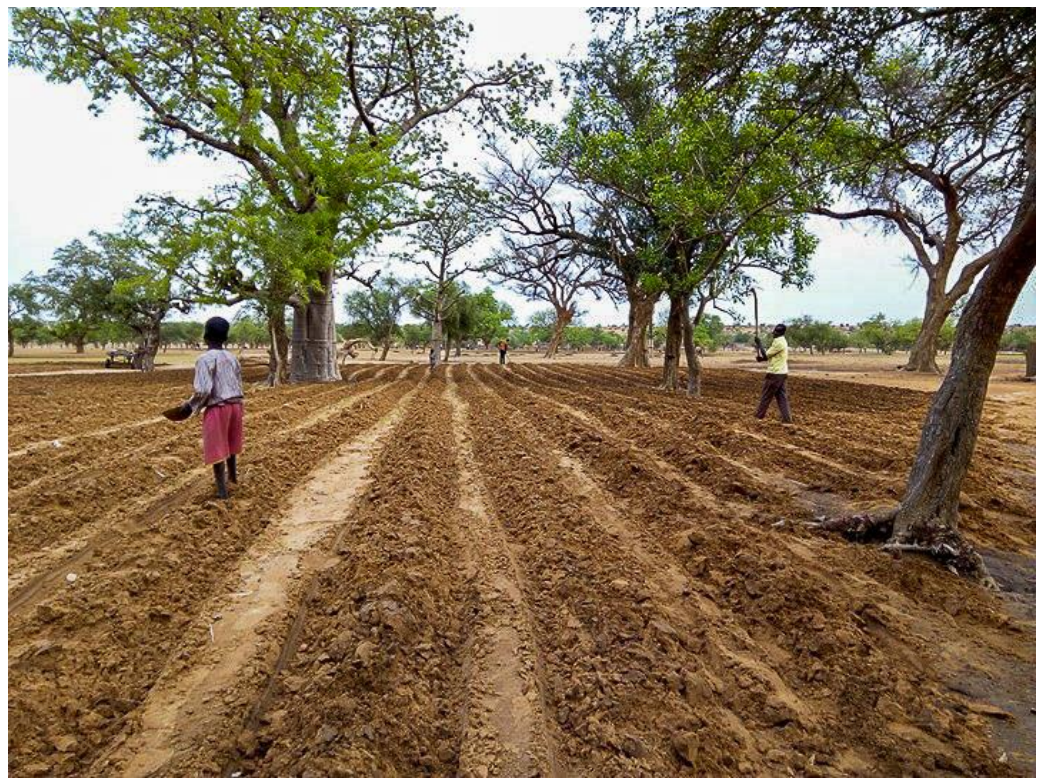
Farming in Doundiourou